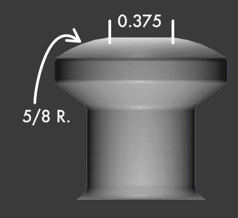
Dimensions in inches