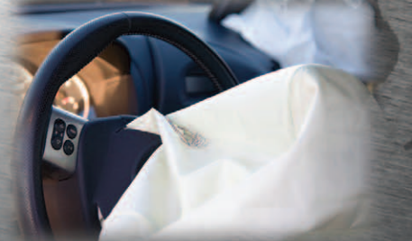
Inflation and Propellants